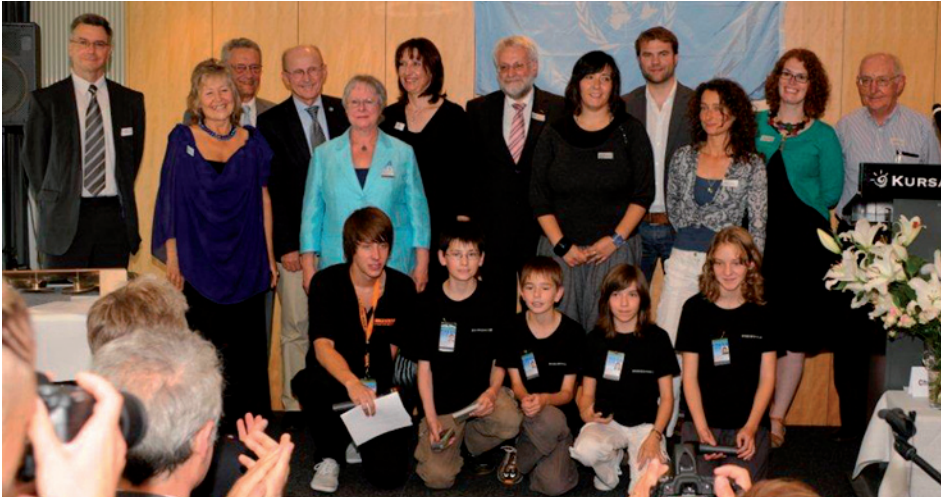
S.E.R. Reconciliation Award Ceremony in Bern, CH, 2010 - Awardees

The impressive S.E.R. Reconciliation Award Ceremony took place at the Congress and Culture Centre in Berne, Switzerland, on August 7th 2010. According to the S.E.R. Action plan, designed for the United Nations International Reconciliation Year 2009, and in support of the eight Millennium Development Goals, twelve outstanding peace projects were honoured at the S.E.R. Award Ceremony.