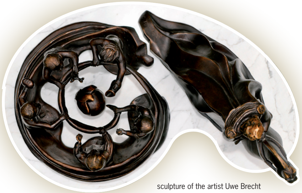
sculpture of the artist Uwe Brecht

another possible solution in eradicating extreme poverty and hunger. A postcard (created by Felicitas Hoffmann) with a short form of the S.E.R. statement which is to be found in full length at www.global-balance.org and www.ser-foundation.de , was endorsed by the Commission and accepted by the conference chairs and allowed to be spread.