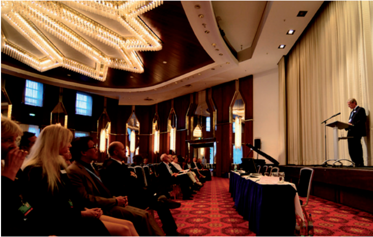
audience award ceremony

In pursuance to the S.E.R. Foundation's Reconciliation "Action Plan 2009," enunciating various special awards that shall be granted to NGOs world-wide, on their exemplary local humanitarian projects and activities, the awards for 2009 and 2010 were recently handed down in simple ceremonies in Bern, Switzerland and Bonn Germany.