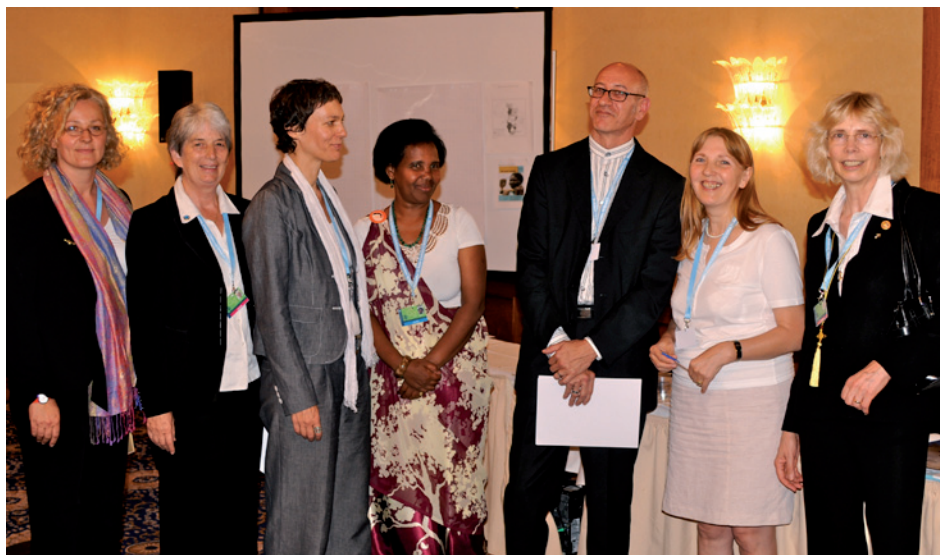
Workshop panellists (middle) with S.E.R. Officials