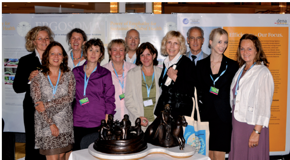
S.E.R. and Ergosoma Team and BSF Representatives , Exposition

peace and justice, so everyone living and building a new World of Peace; as symbolized by the Dove - with Mother Earth in the middle.