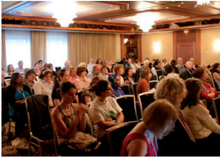
Impressions of the parallel workshops: workshop audience

exhibits participation at the UN DPI/NGO Conference covers (1) Eradication of Poverty through Sharing under the teaching of St. Martin; and (2) under Public Health Program by Ergosoma.